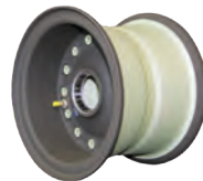
UH-60 WHEEL ASSEMBLY