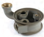
F-15 MANIFOLD SUBASSEMBLY