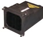
F-15 ENHANCED ENGINE MONITOR DISPLAY