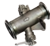
F-15 BUTTERFLY VALVE ASSEMBLY