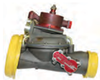
F-15 SAFETY RELIEF VALVE