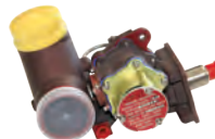
F-16 REGULATING VALVE