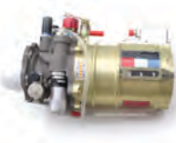
UH-60 HYDRAULIC POWER SUPPLY PUMP