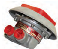
F-15 FUEL SYSTEM VALVE