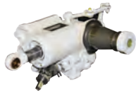
F-15 DAMPER SHIMMY

AllClear partners with Parker to provide distribution of spare and R&OH support for KT-1, F-15, F-16 and UH-60 aircraft in various territories.