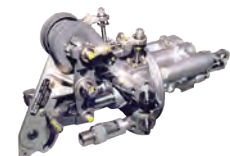
UH-60 TAIL ROTOR SERVO CYLINDER