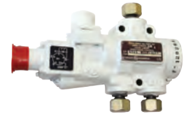
F-15 DIRECTIONAL CONTROL VALVE, LINEAR