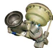
C-130 AIR TURBINE STARTER CONTROL VALVE