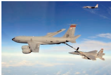
KC-135 refuels an F-15

The Fuel Flow Transmitter functions as the primary source of accurate fuel flow measurement during KC-135 and KC-10 in-flight refueling activities.