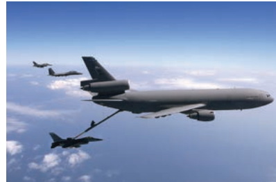
KC-10 refuels a joint-flight of F-15s and F-16s