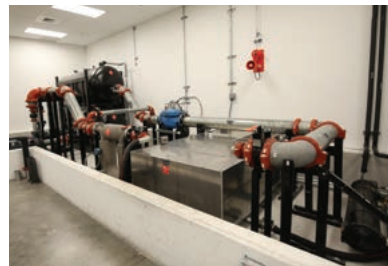
Universal Fuel Flow Test Stand