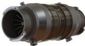
Fuel Flow Transmitter