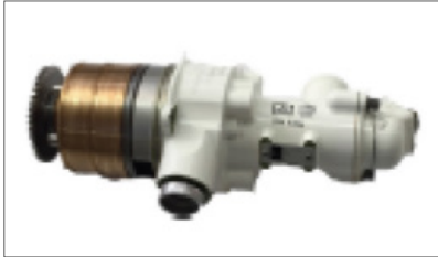
GOVERNOR, PUMP, PRESSURE REGULATING