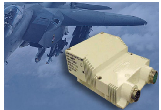
CONTROL UNIT, GENERATOR SAFRAN PN: 3888542-2