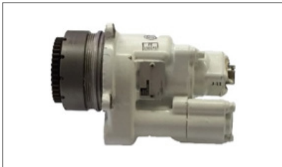
SWITCH & OIL PUMP ASSY

Headquartered in a 70,000 square-foot facility in Cleveland, OH, AeroControlex specializes in the design, development and production of pumps and mechanical systems for aerospace, defense, marine and nuclear markets.